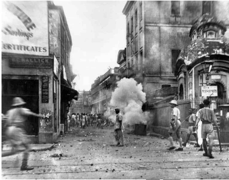
Rioting during Quit India Resolution

launched by Gandhi in 1942 after Cripps Proposals Rejection