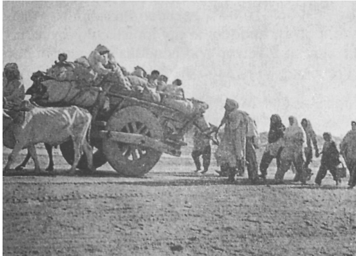
Muslim refugees migrating from India to Pakistan in 1947

Q: What does the Source tell us about the refugee problem in 1947? [5]