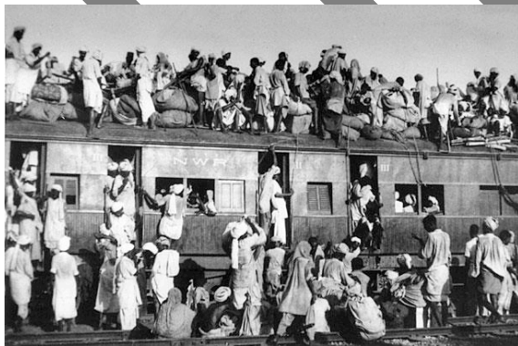
Muslim refugees leaving India for Pakistan in 1947

Q: What does Source tell us about Muslim refugees in 1947? [5]