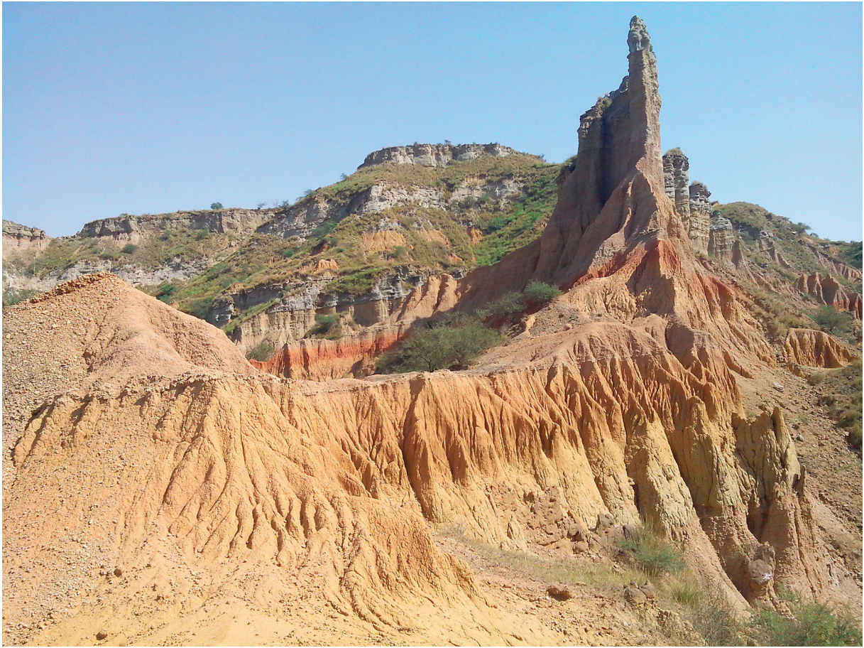
Fig. 1.2 for Question 1