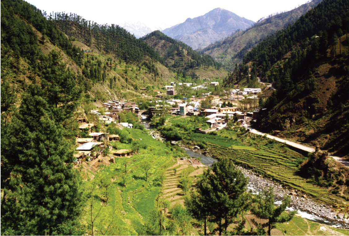
Photograph C for Question 3